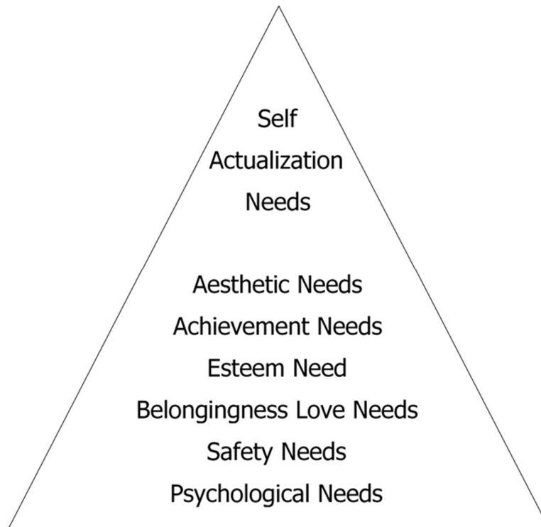
Fig. Figure 1: Maslow's Hierarchy of Needs Theory

One of the most widely mentioned theories of motivation is the hierarchy of needs theory put forth by psychologist Abraham Maslow. Maslow saw human needs in the form of a hierarchy ascending from the lowest to the highest and he concluded that when one set of needs is satisfied this particular need ceases to be a motivator. The hierarchy is illustrated by the figure below: