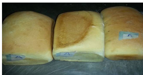
Sample A 100% Wheat flour

The pictures of the produced bread are depicted in Fig. 3 where Sample B with 30% cassava and 70% wheat is the most accepted sample of all the treated samples. Proximate results are also presented in Table 1. Values of moisture obtained ranged from 10.23% (Sample B) to 11.68% (Sample A), were within the values reported by Sanni et.al. (2006) and they are low enough to ensure a stable shelf life of dried products like bread. Highest protein value of 10.67% was obtained in sample A. Protein values ranged from 2.13% to 10.67% with sample D having the lowest protein value and highest carbohydrate value of 82.67%. This inverse relationship between protein and carbohydrate which agreed with the reported work of Oboh and Akindahunsi (2003). The same trends were observed for %ash where sample D has lowest ash value of 1.94% as contrast with highest value of 2.34% in sample A with the lowest carbohydrate content. Result on fat content of the lowest value of 1.03% in sample D with high carbohydrate and sample A with 1.49%. is expected.