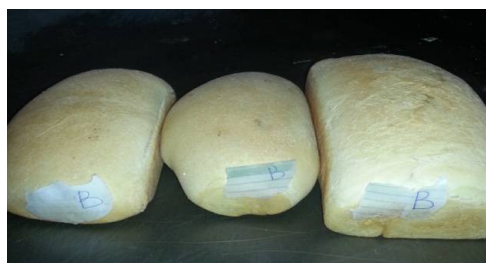
Sample B: 30% cassava:70% wheat flour