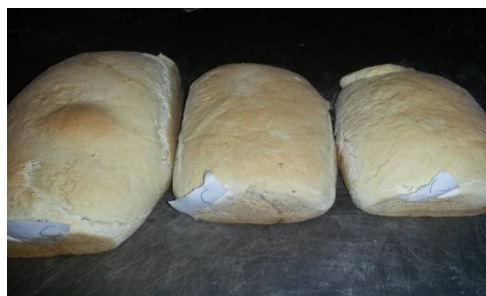
Sample C :50% cassava:50% wheat flour