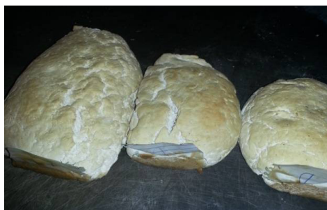
Sample D: 90% cassava:10% wheat flour