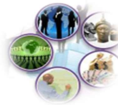
Fig 1: Spreading Christian Teaching and The Gospel

Source: https://www.focusonthefamily.com/faith/whats-a-Christian-worldview/