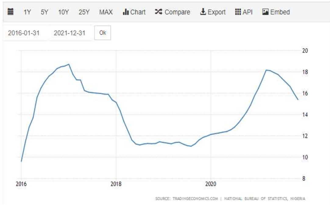
Figure 1: Inflation Rate in Nigeria from 2016 to 2021

The data presented above was employed for the analysis of the study. In 2016, the inflation rate was just 8%, the inflation rates grow to 19% in 2017, however, inflation rate drops to about 15% in 2018, and further dropped to 12% and 11% in 2019 and 2020 respectively. However, an abnormal increase was recorded in 2022 when the inflation rates increased to about 18%. Looking at government policy in the area of ease of doing business in Nigeria. The rate of ease of doing business in 2016 was 169 which was positive. However, the rate of ease of doing business dropped to 145 in 2017. It increased to 146 in 2018. However, a continuous decline was recorded in 2019 to 2021 from 131 to 130 respectively. This implies that the rate of ease of doing business in Nigeria is not favourable to business operators.