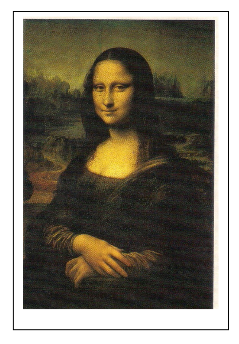
Fig. 3, Leonardo Da Vinci, Mona Lisa, Oil on Panel, 30.4" x 21" (c. 1503)