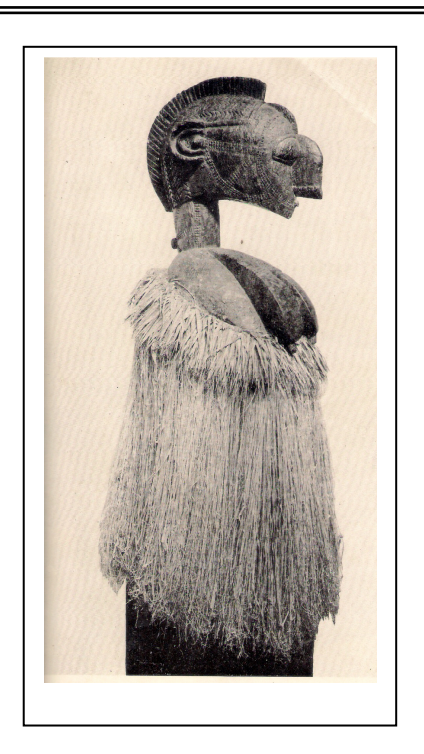
Fig. 2, Nimba Mask, Wood and fibre, Baga, Guinea, 48", (Date unknown)